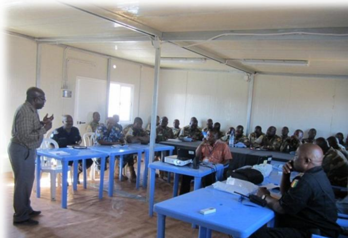
CDT training UNPOL in Kidal - January 2014

The CDT conducts risks assessment visits to the regions and conduct training accordingly.