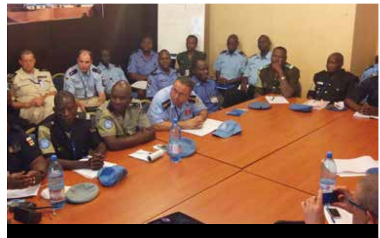
UNPOL officers in training, Bamako, April 2014