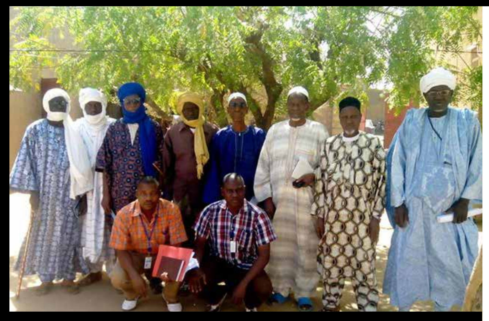
Sensitization session with neighbourhood chiefs in Gao, April 2014