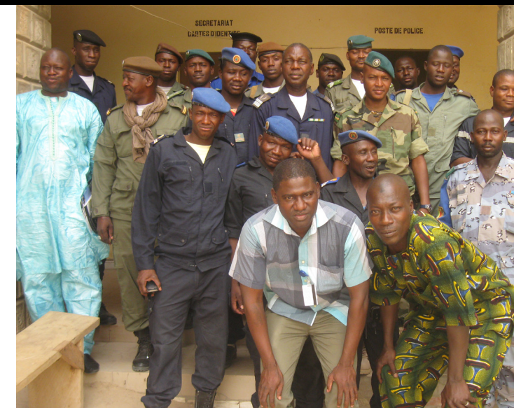
Sensitization session with the local authorities, police station in Timbuktu, June 2014

Outreach for local population is done through meetings with religious and neighbourhood leaders, schools, NGOs and other local authorities in Bamako, Gao, Timbuktu and Mopti in order to inform them about the United Nations standards of conduct, the MINUSMA Code of Conduct, and the type of behaviour to be expected from Mission personnel. They are also informed about the mechanisms to report allegations of misconduct, and the type of assistance that MINUSMA provides to victims.