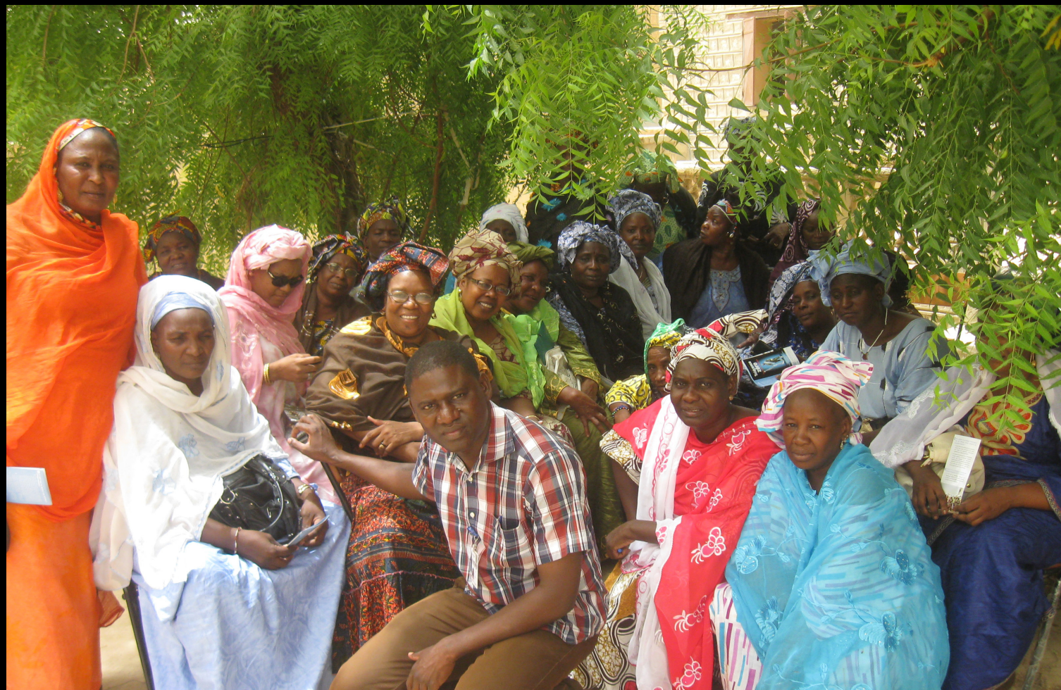
CDT met with women's associations in Timbuktu, June 2014