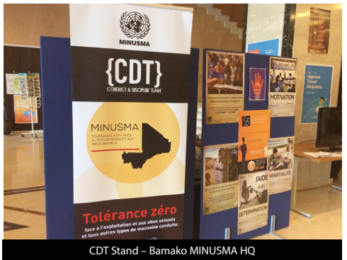
CDT Stand – Bamako MINUSMA HQ

As part of “the 16 days of activism to stop violence against women campaign” CDT conducted awareness raising campaigns on UN Standards of Conduct, including prevention of SEA via a number of community local radio stations in Bamako, including Tabalé FM 94.3 MHZ, Maliba 99.5 MHZ, and Benka FM 97.1 MHZ. The first two stations broadcast all over Bamako and the suburbs of Bamako within at least 60 km. As for the third station, it broadcasts country wide and abroad via the Internet. The listeners of all three stations include a large number of illiterate people. Radio being one of the farthest reaching means of communication in Mali, CDT decided to continue with radio campaigns beyond “the 16 days of activism to stop violence against women campaign”. Accordingly, on 18 December 2015, it conducted another programme on Espoir FM. 91.1 MHZ, a confessional protestant radio station which broadcasts over Bamako city and Sikasso region with the Malian protestant community as its main listeners.