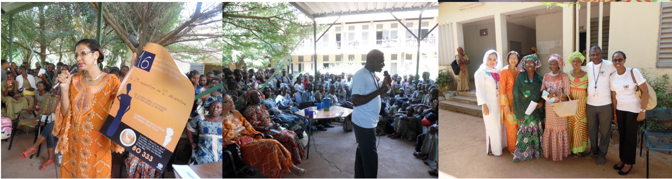
Outreach at Lycee Ba Aminata Diallo and Lycee Notre Dame du Niger

As part of the annual 16 Days of Activism against Gender-Based Violence, CDT conducted sensitization sessions jointly with the Women's Protection office at: Lycée Ba Aminata Diallo and Lycée Notre Dame du Niger.