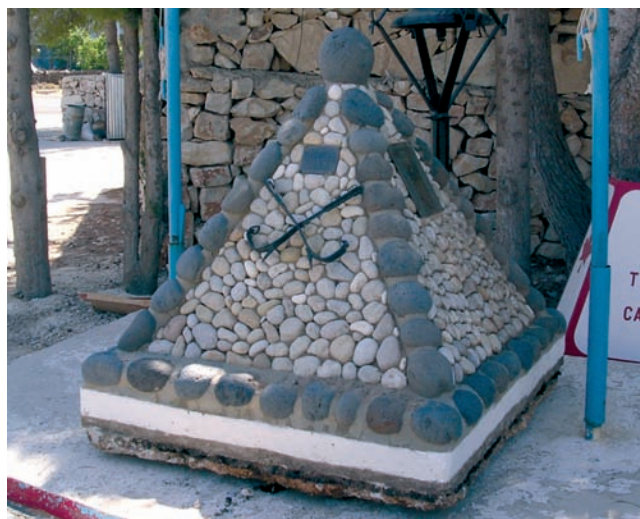
Successful move to Camp Faouar

The decision to move the cairn stems from Canada's decision, after 31 years, to reduce its troop