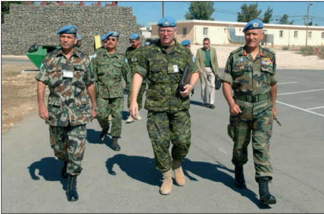
Visit of LtGen R.K. Mehta, DPKO, fact finding of UNDOF activities (28-30th August)