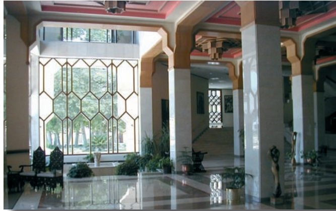
The elegant lobby

Now after more than one year you can say that Dar Al