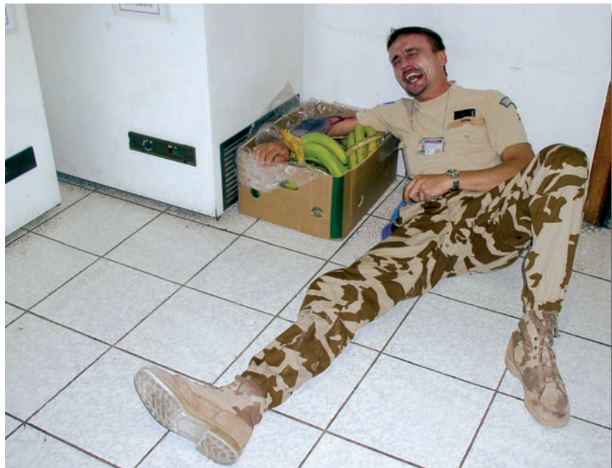
Bitten by a poisonous snake

AUSBATT companies. Even more importantly, there was no real accident during the entire exercise. Exercising is not about exercising as such. It means setting and solving tasks, gaining positive as well as negative experiences and learning from them. The main lessons learnt during this "GOPHER HOLE" were: The alert levels and their corresponding actions have become very used to the companies.