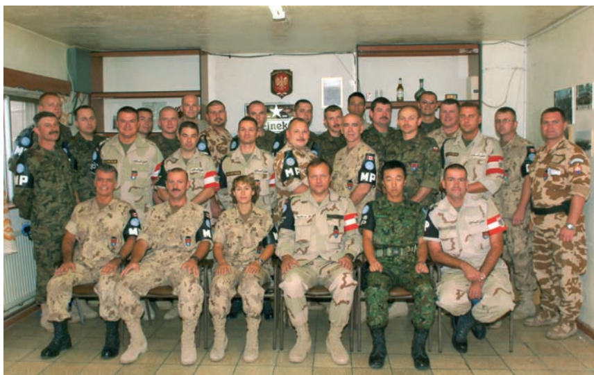
The Military Police Platoon

The first Polish Military Policemen came to the Golan Heights in the year 1978, as patrolmen of the MP post in Damascus and were followed by the first Polish FPM in 1995.