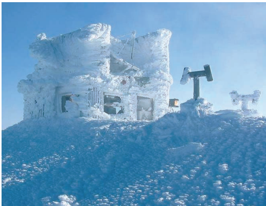
AUSBATT 1 Coy - Hermon Hotel during wintertime