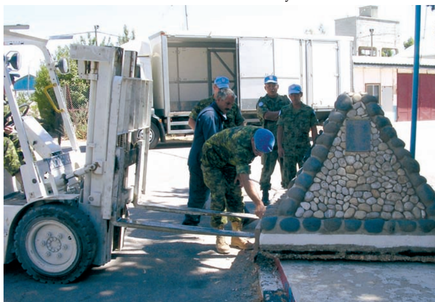
Delicate manoever during disassembly in Camp Ziouani

The vast majority of Canadians are currently situated in Camp Ziouani, where none will remain following Canada's draw down. A Canadian contribution consisting of approximately 40 personnel will continue to provide essential communications, movement control and MP services to UNDOF in Camp Faouar. Further, Canada will continue to fill certain UNDOF HQ staff positions. The presence of the cairn in Camp Faouar will be a perpetual reminder not only of our fallen Canadian peacekeepers, but also of the dangers that our soldiers endure in the service of peace.