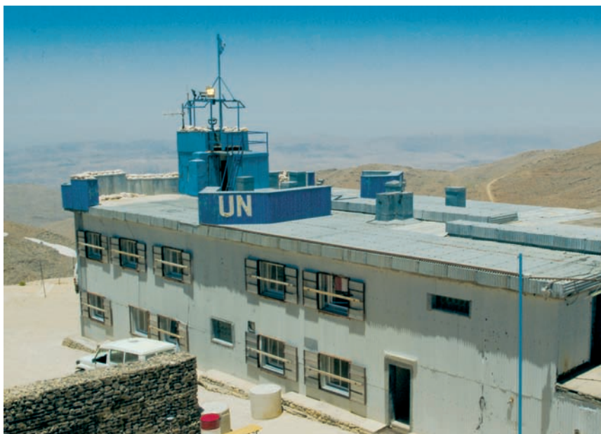
AUSBATT 1 Coy - Hermon Base

To top things off, a fantastic lunch is provided at Hermon Base, as well as the chance to ask questions of the AUSBATT members and further enhance the excellent relationship that exists between OGG and UNDOF.