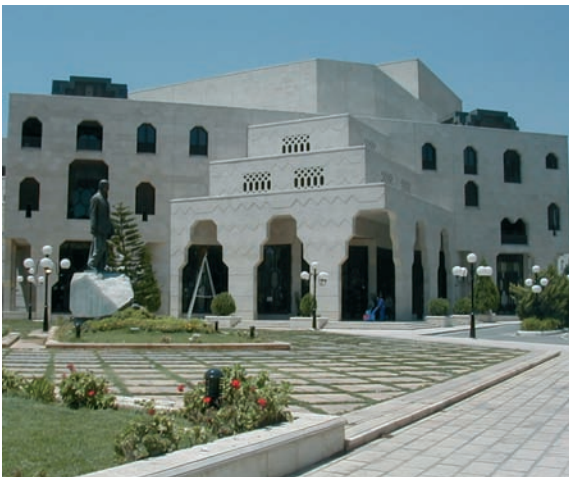
Main entrance of Dar Al Assad