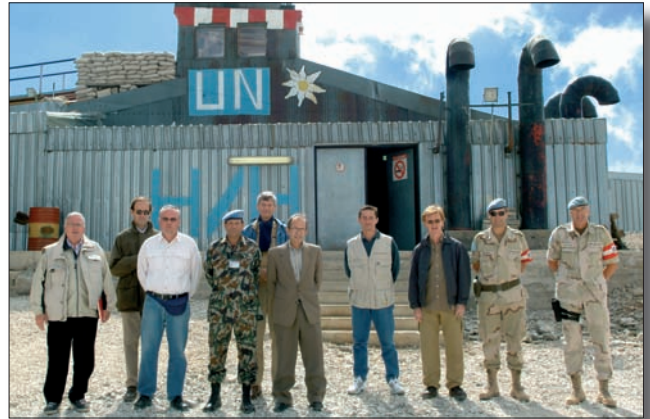
Visit of Ambassadors from Germany, France, Belgium, UK and Czech Rep, got a briefing and visited Hermon Area (17th September)