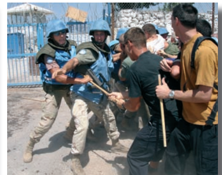
UN soldiers give protection to UN installation