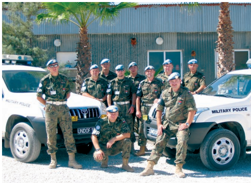
Polish soldiers of the Military Police Platoon

The rotation of Polish MPs is twice a year; March and September, so new Polish MPs will come soon to UNDOF to get new experience in peace keeping missions. MPs, who are preparing to fly home, are very glad of serving in UNDOF best they are also very happy to return again home.