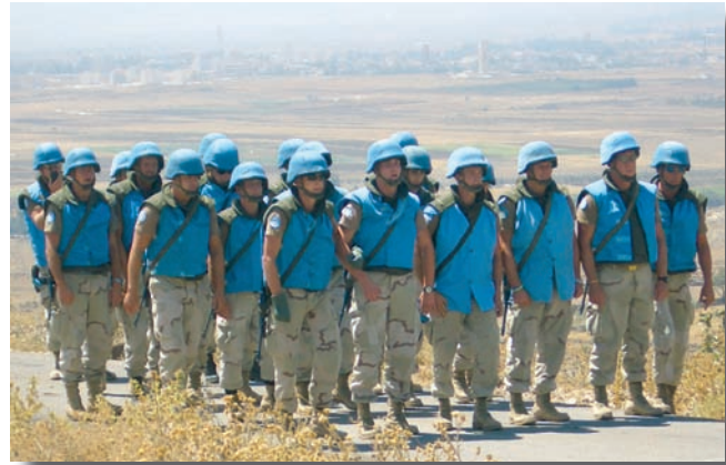
AUSBATT is lining up...

alert level was consequently raised from "YELLOW" to "RED", and all according actions taken. The scenarios included a mountain rescue operation together with the Medical and EOD teams, a shelter alert, mounting of temporary check points, evacuation of a Position due to NBC-threat with subsequent decontamination and first aid and rescue after a car accident. Each day, once the exercise was suspended, concluded with an after action review called "Hot Wash Up", in order to collect the still "fresh" observations. The after action review following the third day revealed an impressive performance of all