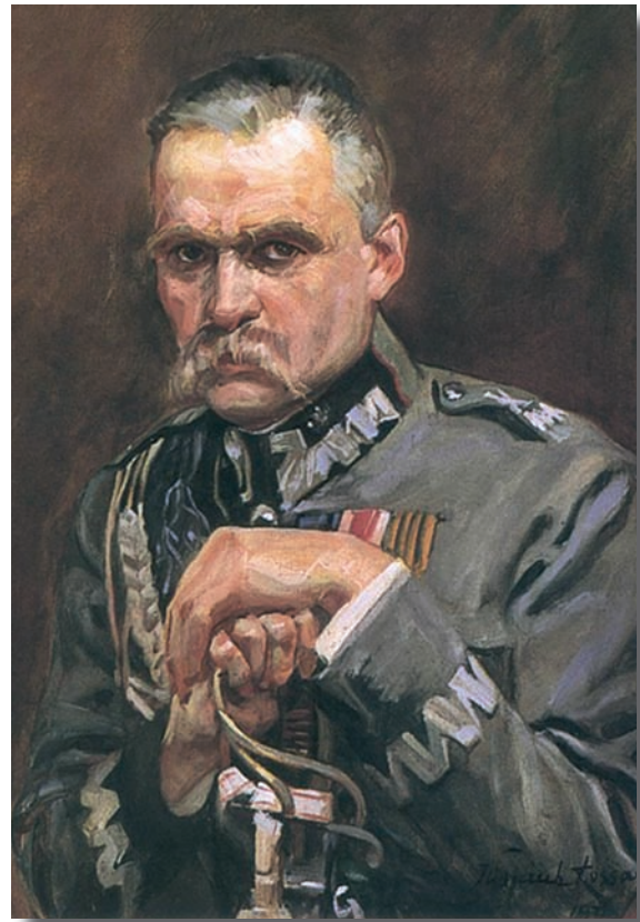
Marshall Joseph Pilsudski

By and large the Warsaw Battle had an enormous impact on the history of Europe. A British diplomat of that time, Earl Edgar D'Abernon, described that battle as "the eighteenth decisive battle in the history of the world". If the Soviets had won that battle they would have marched to the west and initiated the communistic revolution in many west European countries. Its