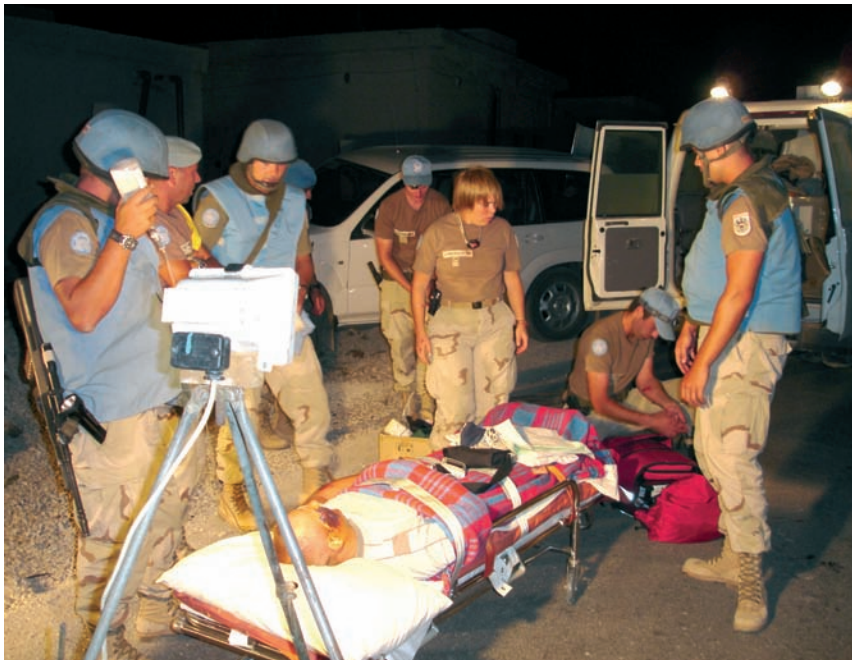
Professional first aid given to exercise actors

The company had done a very good job at all, so it wasn't necessary to overstress the soldiers with preparing their clothes for a possible evacuation. The exercise of the 2 nd Coy came to an end at the peak of the possible incidents and there wasn't more to say than "congratulation to the performance of all participants within the 2 nd Coy"- operational readiness is a fact!