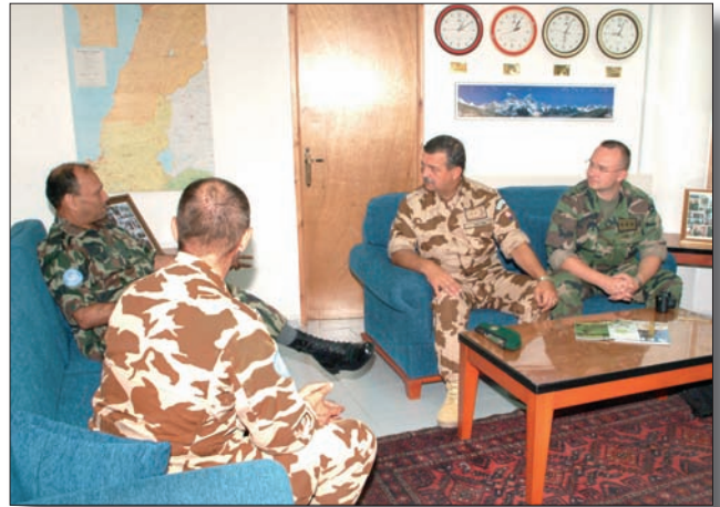
Visit of LtGen Millan Maxim, Slovakia, meeting with FC, fact finding of SLOV-CON's activities (25th August)