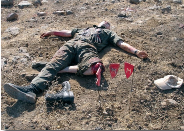
Be aware of mines!

house at posn 37 caught fire. After futile attempts by posn 37 to extinguish the fire, in combination with the fire brigade of posn 27 and CF, they finally were able to keep the fire under control and to extinguish it.