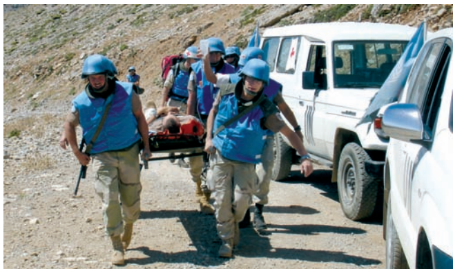
Rescue operation at Mount HERMON

appropriate measures in crowd control. Awareness needs to be built that the "Host Nation" would contribute substantially to calm down impending escalations, which is a situation that is naturally difficult to simulate. All in all the exercise proved to be a clear success. All parties involved - exercise command, participating companies and other parts of UNDOF - cooperated flawlessly. True to the motto "practice makes perfect", AUSBATT's Ops-Branch now intends to build upon the "GOPHER HOLE", to consolidate the Battalion's training level and the quality level that has been achieved in all areas.