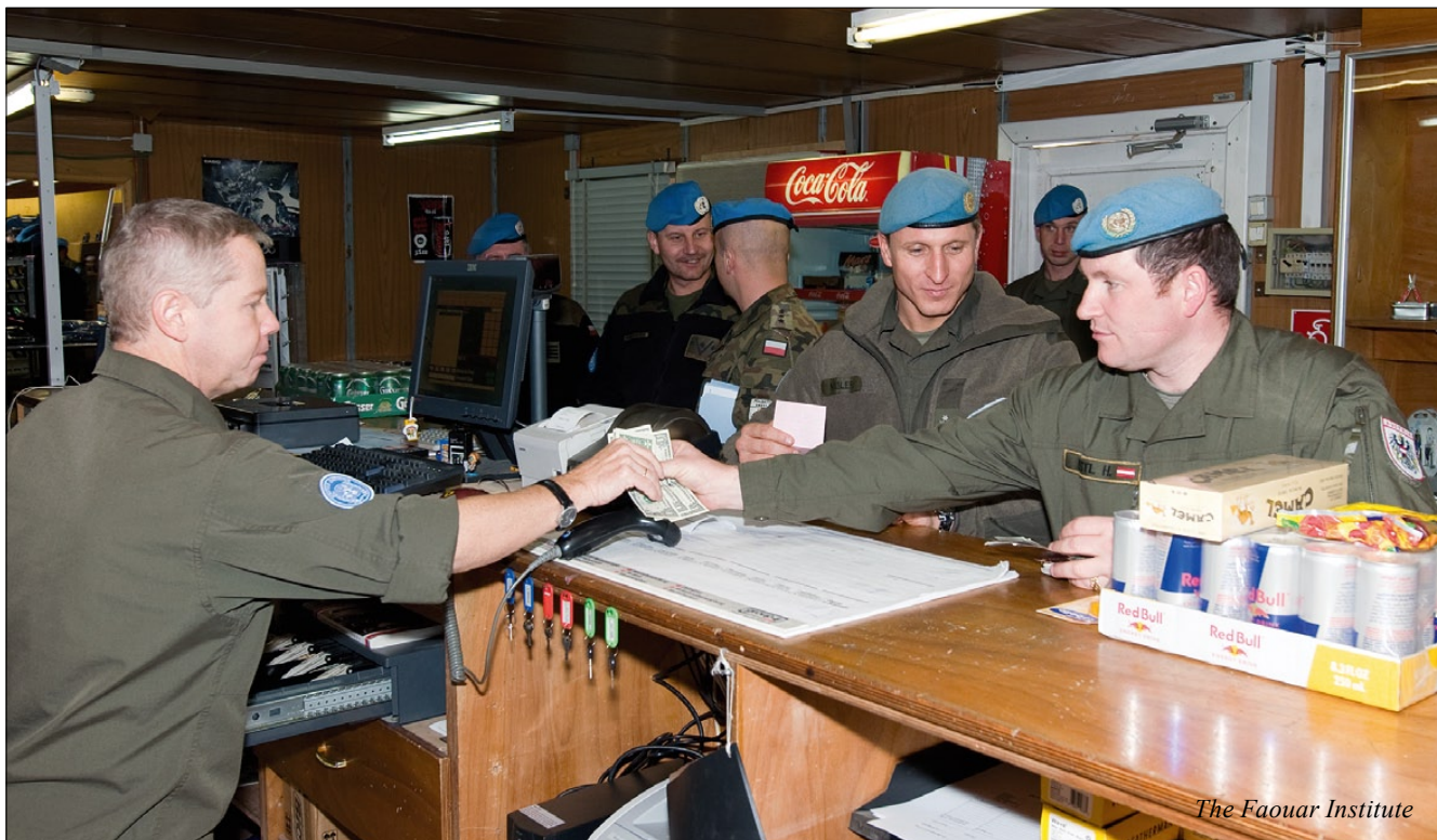
The Faouar Institute

The Faouar Institute (FI) is one out of three Service Institutes run by UNDOF. Located in Camp Faouar, operated by the Austrian UNDOF battalion, it provides a wide range of major consumer durables.