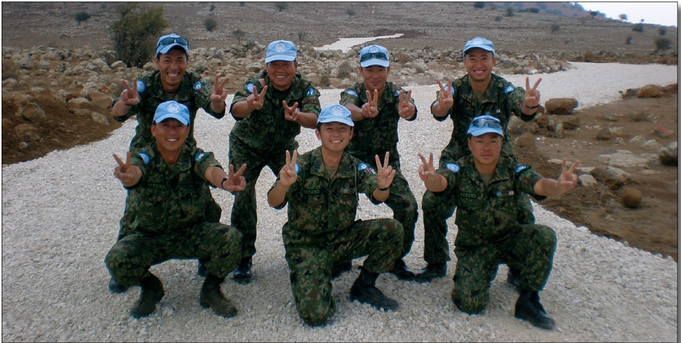
Congratulations on completion of the work!

One of the most important jobs of J-CON Detachment section is to construct and/or maintain the roads by use of heavy equipment.