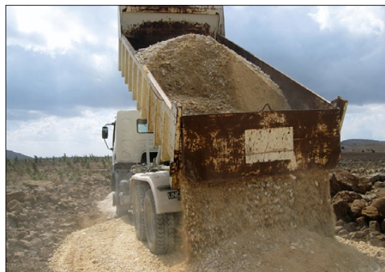
Dumping the gravel

park our heavy equipment at the site outside of the base camp and during the days we frequently refuel at one of the UNDOF positions in the area of separation and have our meals there.