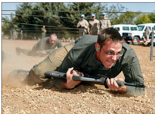
Going for the best