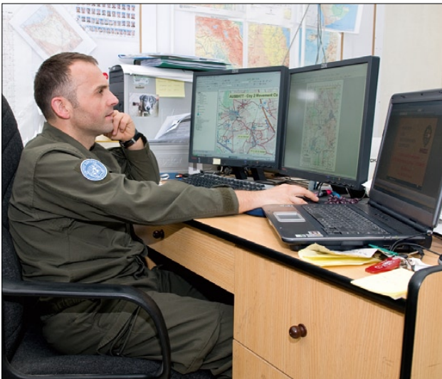
GIS officer working on UNDOF maps

The unit has also assisted in numerous fieldworks in the context of re-barrelling projects and estimation of field violations along the A-line.