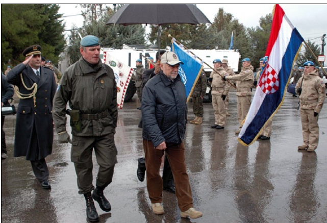
H.E. Stjepan Mesić, President of the Republic of Croatia, celebrated Christmas with Croatian soldiers in Camp Faouar (24 th -25 th Dec 2008) see also on page 12-13