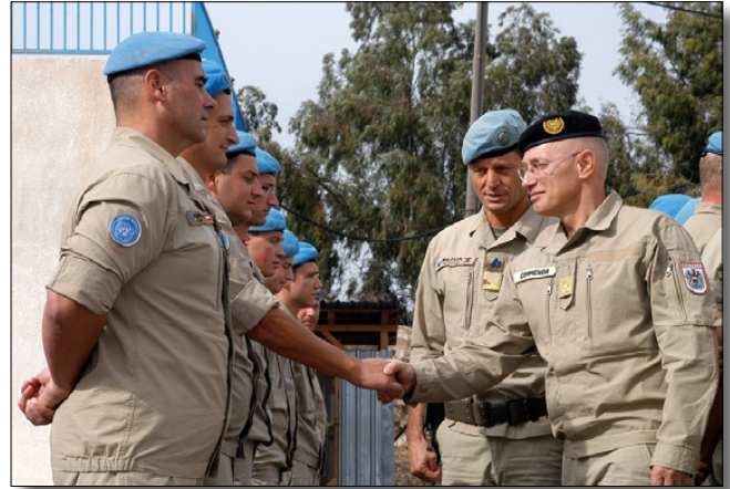
LtGen Othmar Commenda, Deputy Chief of the General Staff of the Austrian Armed Forces, visited AUSBATT (here on Posn 27) and HRVCON (22 nd -24 th Oct 2008) see also on page 14