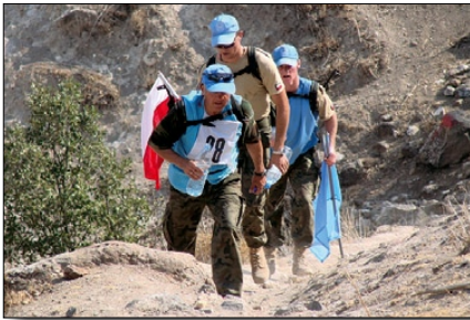
Steep route in the Wadi Raqqah

The series of marches which are organized in POLBATT's Area of Responsibility (AOR) was initiated with the so called Wadi March on 11 th Oct 2008. On the start of the most difficult and the most exhausting Polish march, emerged over 100 competitors representing all military contingents executing tasks under auspices of UNDOF.