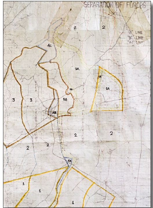
Original treaty map (1974) in FC Office

the three phases of data collection, data processing and data visualization. As mentioned earlier, the rate of land use change is accentuating in the Golan - a road could appear suddenly one day, and two weeks later it could be asphalted. These changes cannot be reflected automatically in the map database with-