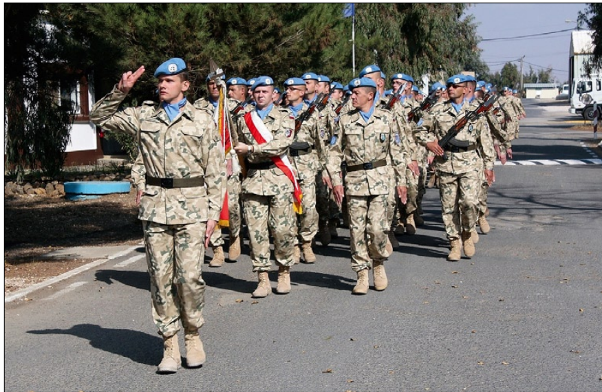
The solemn parade of Polish soldiers

an easy period of time for Poland due to the fact that during the next two years we had to fight again defending the country against the Bolshevik expansion from the East. It was not only fight for new democracy for Poland but for democratic Europe as well. The idea of independence has been cultivated and has been an object of the wishes and aspirations of many generations. The prosperity of the homeland has always been their highest goal during the period of twenty years between the two wars had been for the baby-young country the time of hard work to rebuild the economy and to catch up with other well-developed countries. After breaking out of the Second World War Poland once again became to be the theatre of inten-