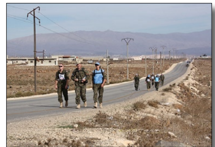
On the long, long Coyote March

The Coyote March on 8 th Nov 2008 was the last march organized in POLBATT's AOR. The route of the march ran again in very flat terrain, yet during this march participants had to get over the longest distance of about 28 km. Participation in marches like this for many soldiers is like narcotic. They do not avoid any opportunity to take such a test of their psychical and physical endurance.