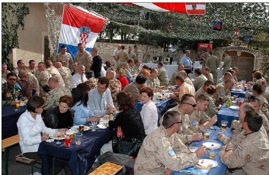
A nice companiable evening

one of those 95 Croatian soldiers was proud to stand in line together with their Austrian comrades to receive after four months of duty the UNDOF medal.