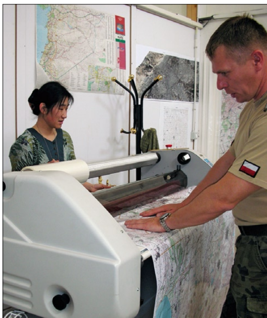
Just press button "print"? Laminating maps in order to extend their longevity

ery can be observed, combined with a digital elevation model, vector and