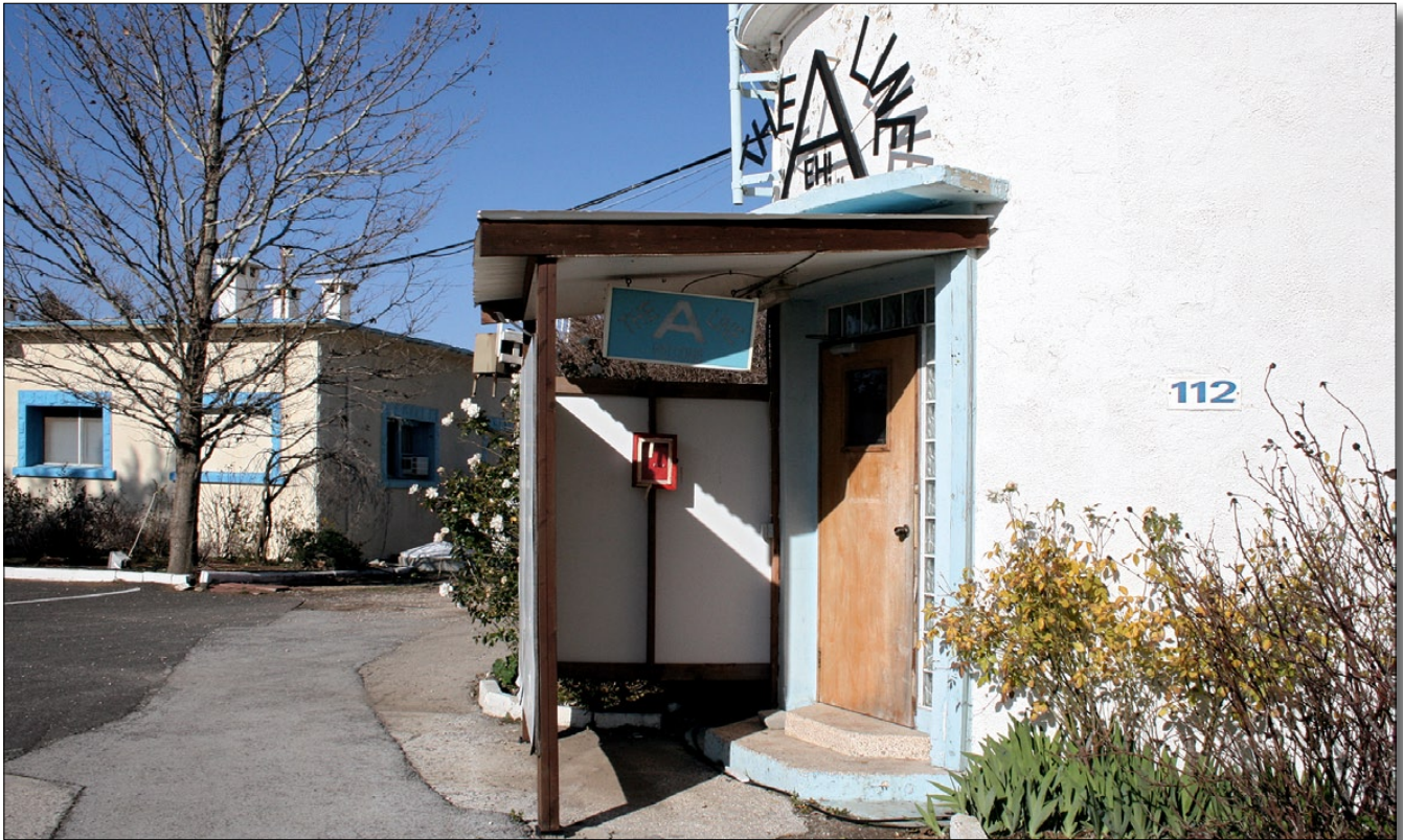
The A-line club in Camp Ziouani

Located by the main gate, the A-line club in CZ is known as “Friday’s Oasis” to those living in the Camp. The opening hours are 19:30-22:30hrs every Friday. The A-line club provides the opportunity to communicate with people from many different nations. In addition, one can become familiar with Japanese unique culture and after-work hours traditions.