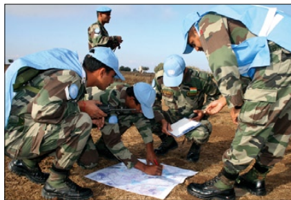
GPS Training in the field

With the second flight landing on 13 th Dec 2008, the balance of the sixth rotation was inducted and INDCON was ready to face all challenges. It requires training to