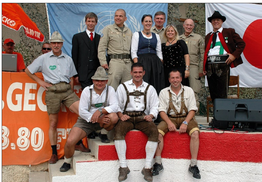
UN-soldiers in their typical national costume

On 24 th Oct two contingents, the HRVCON and the AUCON assembled on the parade square of Camp Faouar. The Croatians, who are the youngest contin-