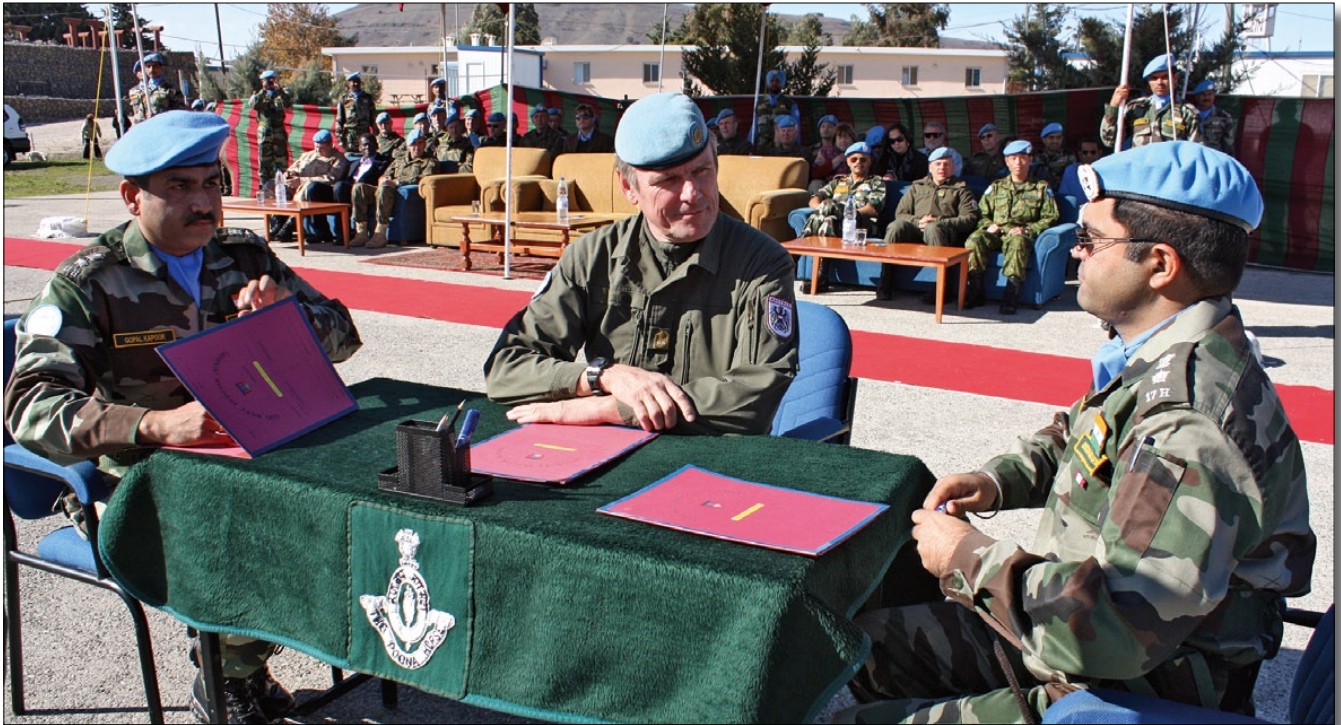
Handover/Takeover of the CO-LOGBATT in December 2008

It was a cold, rainy night on 27 th Nov 2008 when the first flight of the Sixth Contingent of INDCON landed at Ben Gurion Airport. The four hour ride to Camp Ziouani was full of questions and anticipation. The warm welcome from soldiers of all contingents lined up at the Camp Ziouani Gate more than made up for the cold of the Golan. The men were quickly led away to enjoy a hot meal and a warm bed.