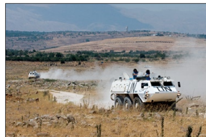
FHQ-Coy in the "Grazing Area"

Our next stop is at Barrel 30A where a shepherd crossed unjustly the A-line which represents a violation of the agreement. Friendly but forcefully we try to get him back to the eastern side of the A-line. Although he follows our instructions we have to fill out our report forms anyway. Furthermore we have to inform the 2 nd Coy and report to the Operation Center via radio.