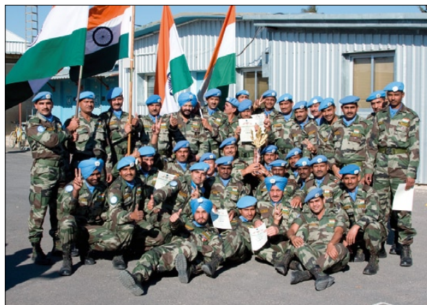
The overall winning team of INDCON

Achieving the GOLD trophy is all contingent's goal. The trophy is a challenge and stays with UNDOF. In the next competition all contingents have the chance to win the trophy. Is one contingent winning the trophy 3 times in sequence it shall go to the contingent for good.