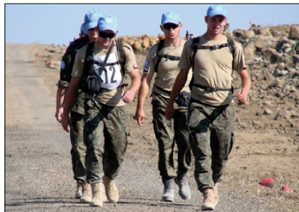
Polish soldiers on the Scorpion March

The Scorpion March on 18 th Oct 2008 was the next Polish march, which similarly like the Wadi March attracted on its start over 100 competitors. One can notice among the participants of this march there were many persons who struggled with the Canyon Wadi one week earlier. The route of the march with the length of