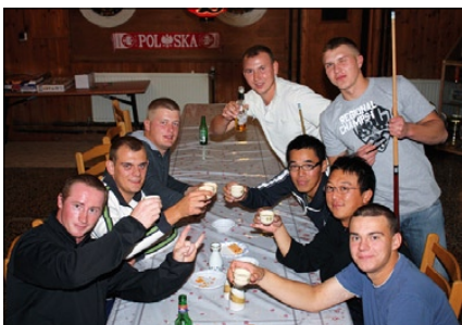
Enjoy the sake in the A-line club