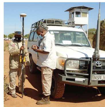
Preparing for a route assessment