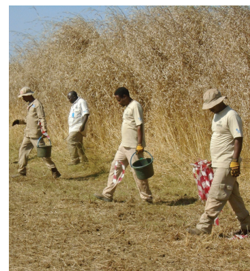
UNISFA Rumamier Battle Area Clearance

The coordinated effort from UNMAS UNISFA has provided vital services to a community desperately in need of reassurance and access to their most vital resources. Furthermore, the successful completion of the tasks facilitates the dry-season force mobility of UNISFA in a safer environment. The removal of many explosive ordnance has strengthened confidence by UNISFA and Abyei communities to carry on with their daily routines. It ultimately brings greater security to the Abyei Area and enables UNISFA fulfillment of its mandate.