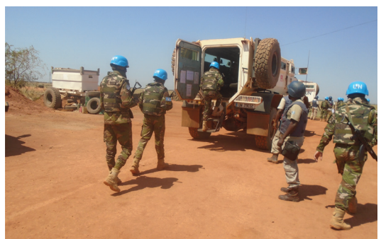
Ground monitoring mission in Tishwin