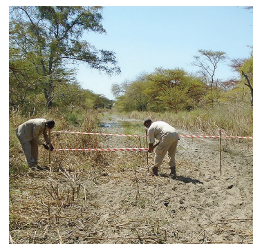
Marking a waterlogged area