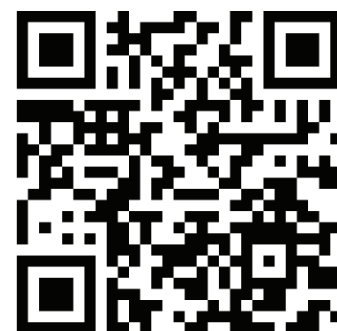
Scan for more information about UNMAS Abyei

IF YOU SEE AN ITEM OF CONCERN, DO NOT TOUCH IT! CONTACT UNMAS UNISFA IMMEDIATELY!