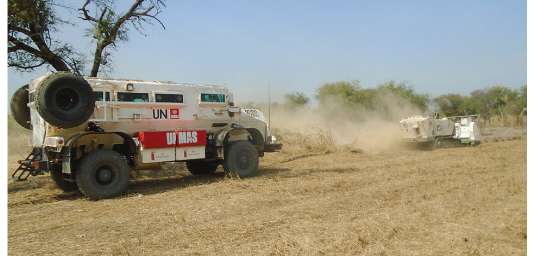
Mechanical clearance at Tajalei