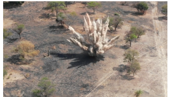
Demolition in Khar Alei