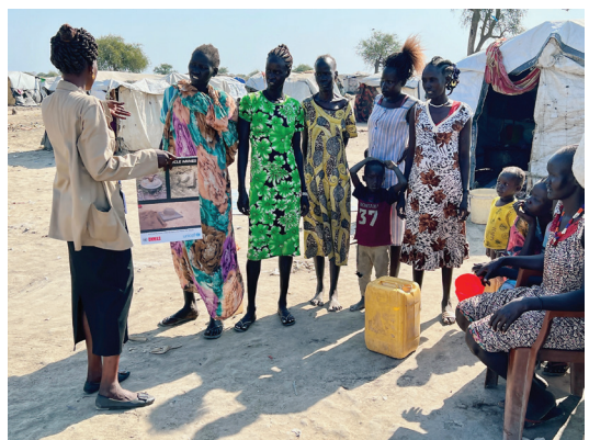
EORE session in Abyei