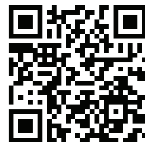
Scan for more information about UNMAS Abyei

IF YOU SEE AN ITEM OF CONCERN, DO NOT TOUCH IT!