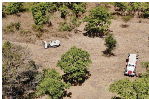
Mechanical ground preparation