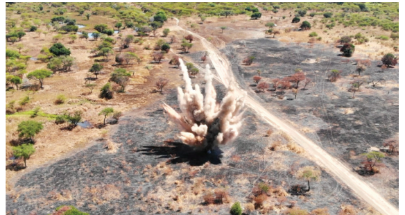
Destruction of 12 ERW at Khar Alei