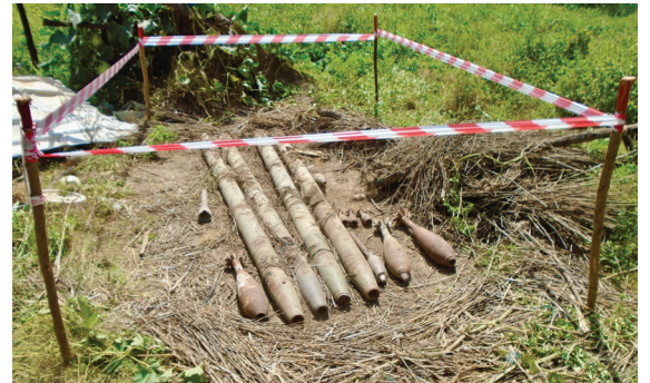
16 ERWs found at Fanikan village on 2 November