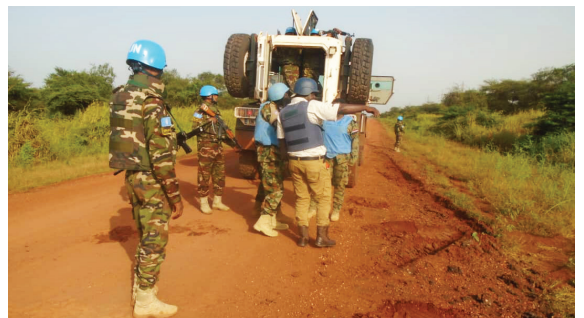
Ground monitoring mission in Tishwin