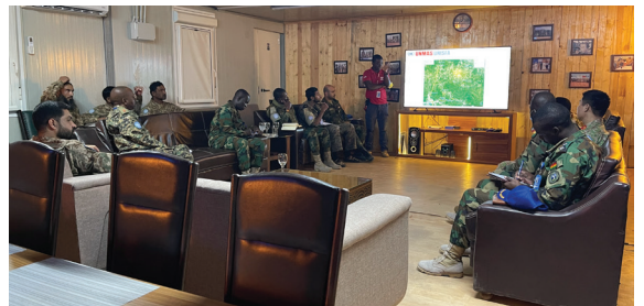
Safety induction at Todach COB