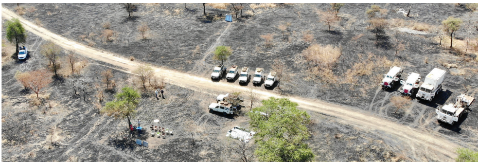
UNMAS mobile team