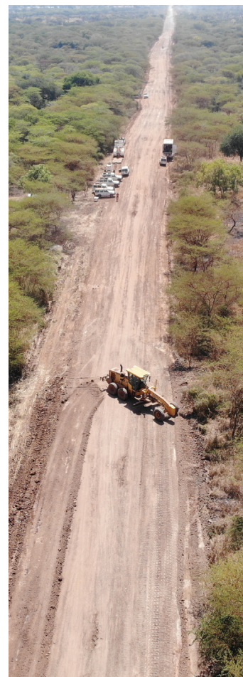
UNMAS enabling UNISFA to rehabilitate roads

The successful completion of this task by IRACT will facilitate and allow UNISFA Engineering Section to conduct excavation works in support of the integrated force mobility efforts. The soil from the excavation shall be used for the rehabilitation of this MSR which has been impassable with the prolonged rains and extreme flooding in the region, thus enabling free movement of UNISFA personnel and civilian vehicles. The CLOs within IRACT conducted interviews with the local populations during the task to gather information on the challenges faced by the lack of road infrastructure. They are able to explain the purpose of the IRACT’s work which can reduce tension, instill confidence and also allow explosive ordnance risk education to be given to the population in the area of the task. The efforts of UNMAS were highly appreciated and welcomed by the community, thus paving the way for business revival and promoting socio-economic recovery.”